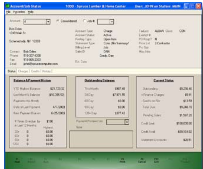
The Status tab of the A/R status inquiry

In addition to looking up credit-related information such as that on the example above, the A/R Status can show current, last statement, or last 120-day listings of charges and credits. The history tab also allows a look at all activity on the account for any time period, and can be done for a specified job or for all jobs (consolidated). There is an option to print the information in a current-status “statement” format or as a historical activity list.